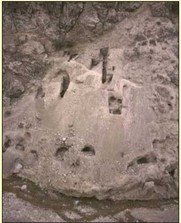
Figure 4. Robber holes on the west bank of the Jam Rud (photograph taken from the Minaret, during MJAP excavations).

We limited our work to surface collection and re-excavating robber holes, so as to minimise our impact on the site (Figure 4). Unsurprisingly, the deposits along the proposed route of the much-needed road and bridge were highly disturbed. Our excavations, however, yielded a wide range of ceramics, including glazed sgraffiato wares. We also recovered pieces of stucco, fine painted wall plaster and a couple of small coins, the better preserved of which is Seljuk in origin and has been dated to the early twelfth century. Although limited, these finds indicate the import of luxury items, a relatively high standard of living and concern for aesthetics amongst the inhabitants of Jam.