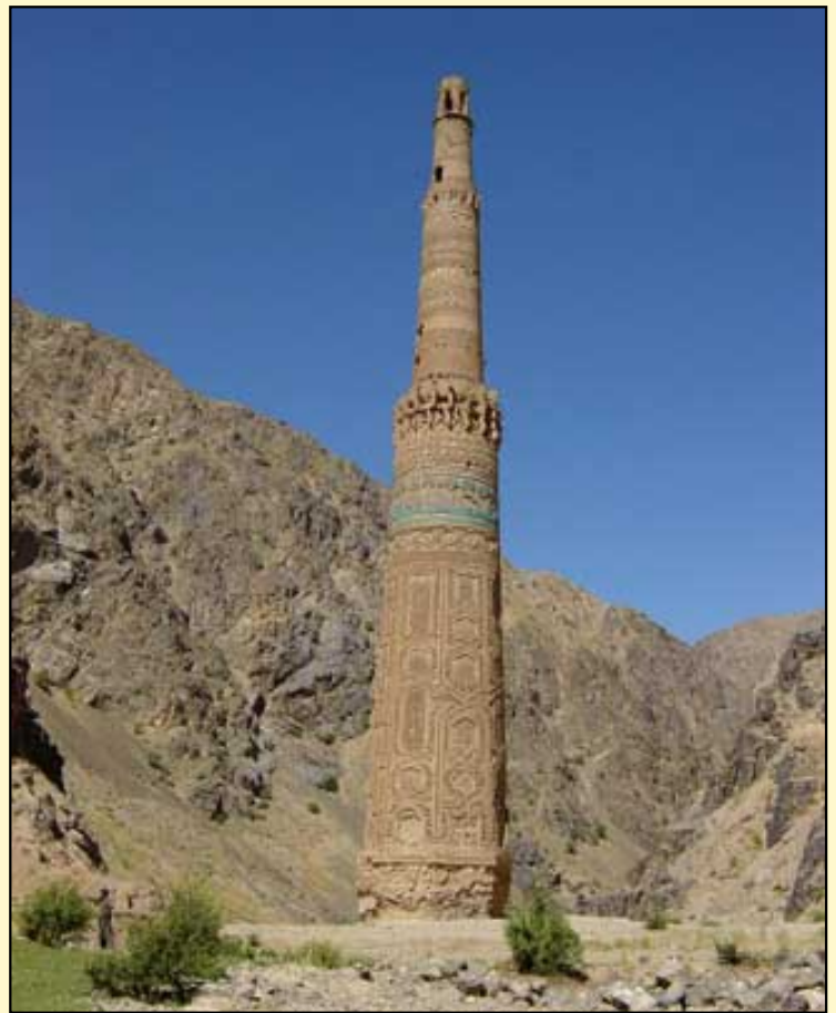
Figure 1. The Minaret of Jam - at 63m high, the second tallest mud-brick minaret in the world.

Jam is located in the Ghur province of western Afghanistan, an inaccessible, mountainous region c. 200km to the east of Herat (Ball 1982: 133; Figure 3). The geographic isolation and harsh, impoverished environment has had a profound influence on the historical and cultural developments in Ghur. Their