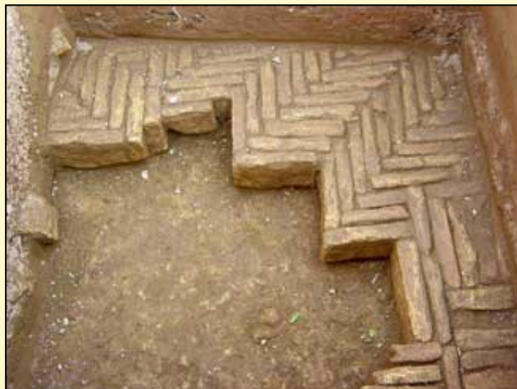
Figure 6. 'Herring-bone' pattern baked-brick paving found in a robber hole near the Minaret

The potential and urgent need for further archaeological work at Jam is clear, particularly in the light of the extensive looting. The exposed baked-brick wall and paving, and their proximity to the minaret, provide tantalising evidence of a large, high-status building, possibly the mosque Juzjani refers to. In future seasons, we hope to conduct geomorphological and geophysically surveys and targeted test-pitting to the east of the minaret to 'ground-truth' the survey results. Such work would hopefully define the nature and extent of the courtyards and the major building associated with the Minaret of Jam.