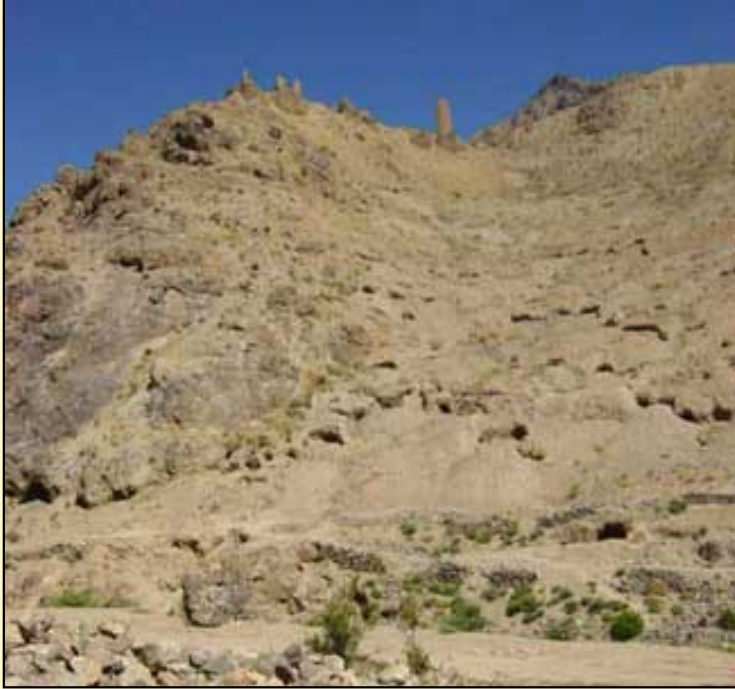
Figure 2. Qasr-e Zarafshan and 'Bazaar' area, on the north bank of the Hari Rud - the tallest surviving mud-brick tower in Qasr-e Zarafshan stands over 80 courses high.

neighbours regarded the Ghurids as little more than petty chieftains and mountain brigands (Bosworth 1961: 121-123) and their isolation and independent streak still results in periodic tension.